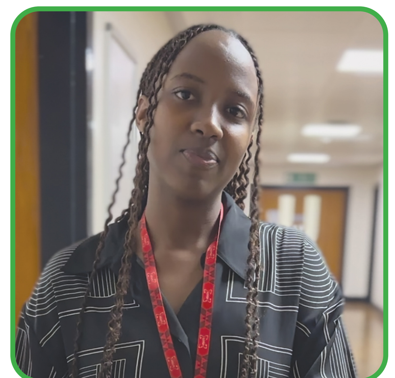
Alexa - Rwanda

Project Earth doesn't just teach about climate change. It builds hope, competence, and agency. It shows young people that their ideas are valuable, their actions can create change, the world needs their brilliance - now.