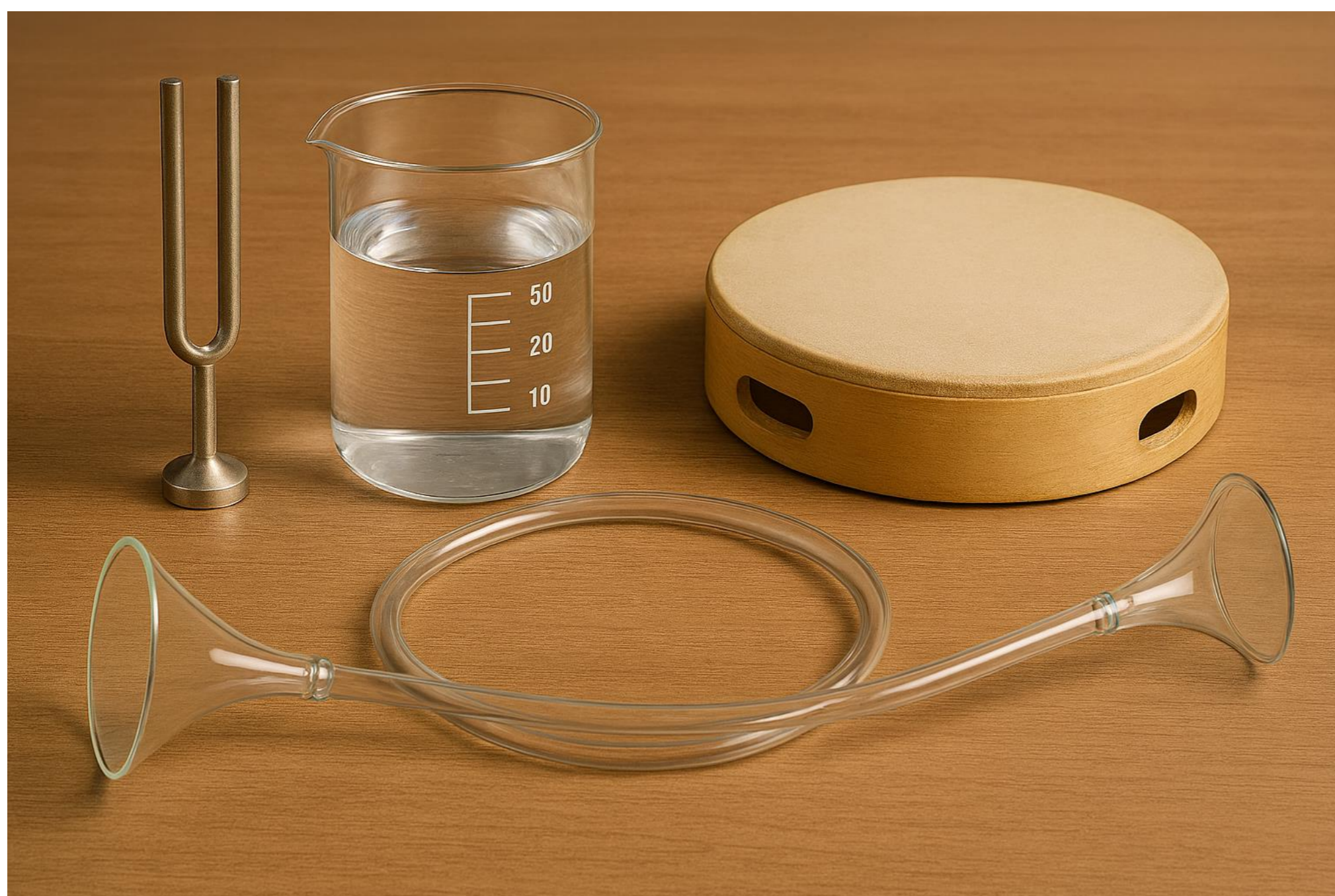
Abb.2: Materials needed for the experiments

In this curriculum corresponding learning unit, students explore the topic of hearing through a digital story about a supposed case of sudden hearing loss.